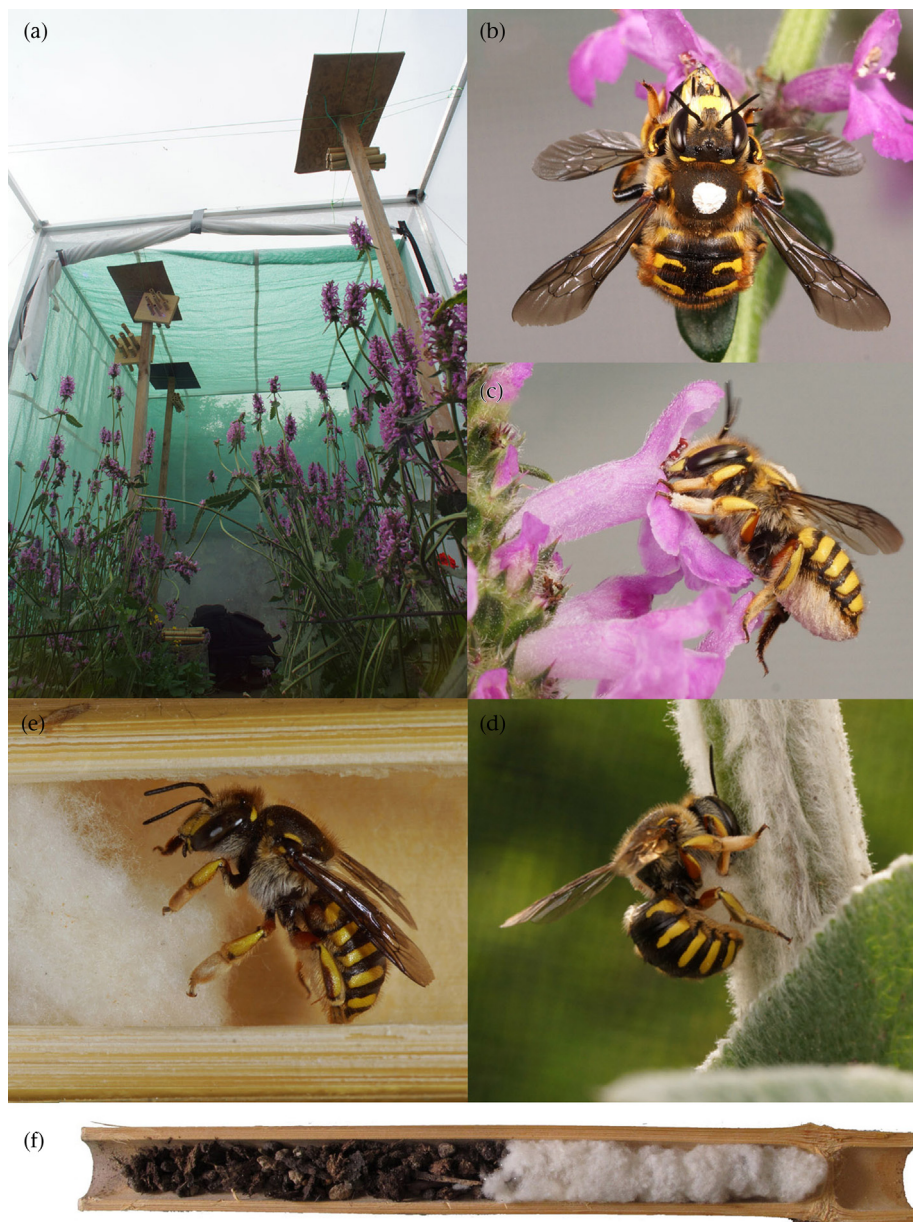
Figure 1. Breeding Anthidium manicatum in the Botanical Garden of the Ruhr-University Bochum. (a) Flight cage with food plants and bamboo trap nests, (b) copulating pair, (c) female drinking nectar and collecting pollen from Betonica officinalis (note pollen-filled hairy scopa at metasoma), (d) female scraping off plant-wool from Stachys byzanthina , (e) female provisioning brood cell in bamboo internode, and (f) completed nest in bamboo internode with five brood cells and nest plug made from substrate particles.

For each locus the repeat motif, fragment sizes (bp) and number of alleles ( N_A ) are given. N_1 (♀/♂) is the total number of individuals and the numbers of females and males that could be genotyped. The size range (bp), N_1 and N_A are based only on adult individuals. H_o and H_e are the expected and observed heterozygosities, based only on adult diploid females. No significant deviations from HWE were detected. The primer sequences that include an M13 tail (5'-CACGACGTTGTAACACGAC-3') are marked with an asterisk.